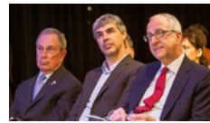
Google Makes Space for City Tech School