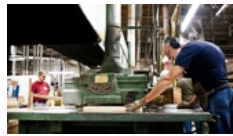
Born in a U.S.A.-Made Crib