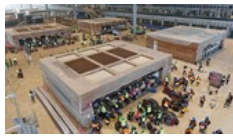
Berlin's New Airport Racks Up Delays Even Before It Opens