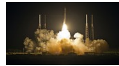
Private Spacecraft Heads for Station